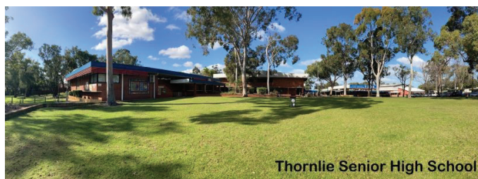
Thornlie Senior High School

Thornlie Senior High School recognises that the world around us is changing and we are changing with it. Our students come to us from many different backgrounds, but they leave with one thing in common – a great education and a significant head start in life. Thornlie SHS students develop the skills they need to thrive in the challenging, interesting and dynamic 21st Century.